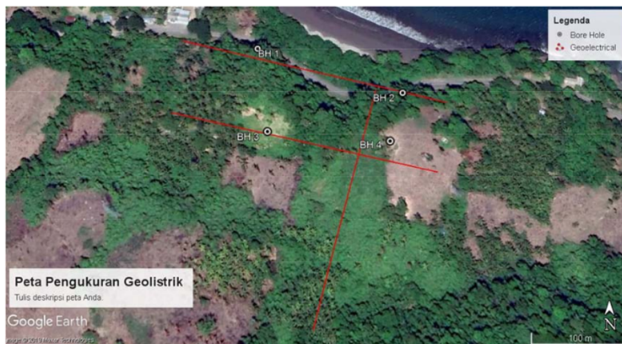
Figure 1. Location of the ERT profile and borehole position, Sampiro.

The data sets were processed and inverted using RES2DINV based on a smoothness-constrained least-square method which allow to obtain 2D section through finite differences or finite elements computations, taking into account the topographic correction.